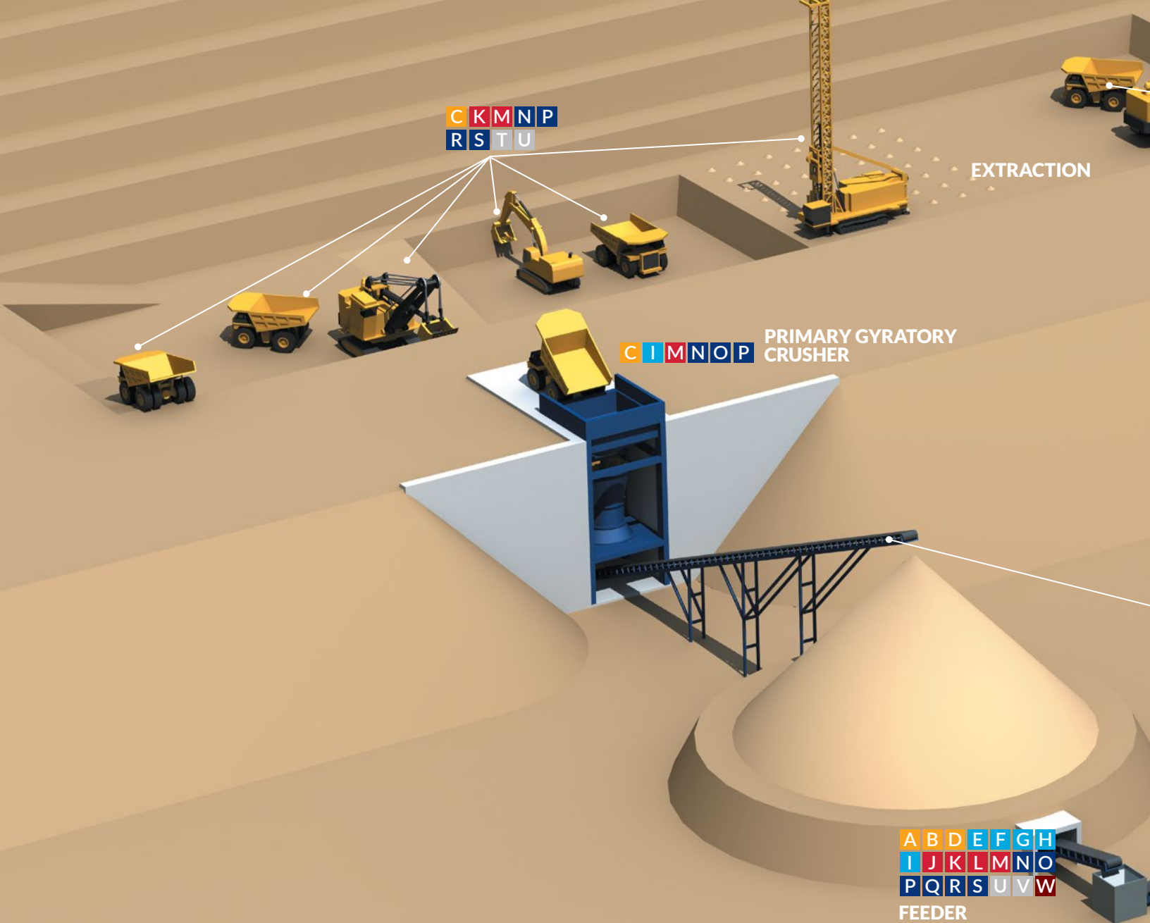
Map shows a typical copper sulfide ore processing facility.