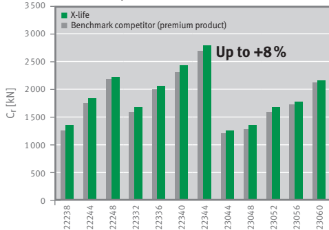
Dynamic load rating comparison, series 222, 223 and 230