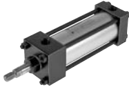
A and EA Series Aluminum NFPA 1-1/2" - 12" Bores Single and Double Acting