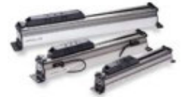
Lintra® Lite A44000 Lintra® Lite Rodless Cylinder 25mm - 40mm bores Compact, lightweight design