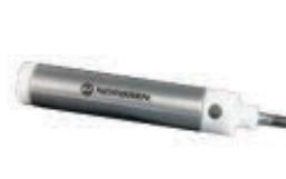
RPD Series Delrin Delrin End Cap Roundline 9/16" - 2" Bores Double Acting