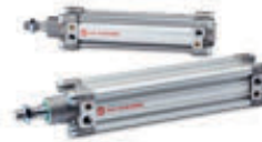
ISOLine™ ISO 15552 32mm - 320mm Bores Double Acting Exposed Tie Rods or Profile Tube