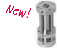
F-Plus Multi-Power/ Multi-Position Compact Round Body cylinder Multiply force output Multiple positions in limited space