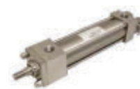
SS Series Stainless Steel NFPA 1-1/8" - 8" Bores Double Acting