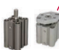
EC/GC Series Extruded Compact Actuators 12mm - 100mm bores Standard and guided models