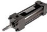
J and EJ Series Steel NFPA 1-1/2" - 12" Bores Single and Double Acting