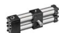
Rotary Actuators Rack & Pinion Rotary 1/2" - 2-1/2" Bores Single and Double Rack, Multi-Position