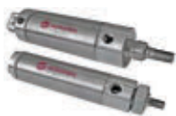
RP Series Roundline Plus Round Body Disposable 5/16" - 3" Bores Single and Double Acting