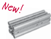
3C/QC Series Extruded Multi-Power/ Multi-Position 12mm - 100mm bores Extruded body alternative