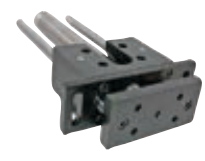
RT Series Thrusters Roundline Linear Thruster 9/16" - 3" Bores Composite and Roller Bearings