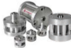
F-Series Plus Round, Compact cylinder 9/16" - 3" Bores Single and Double Acting