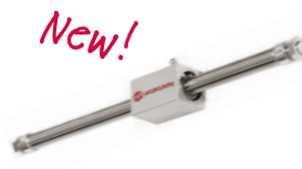
MC Series MC2/MC3 5/16" - 2" Bores Magnetically Coupled Rodless Unguided Cylinder