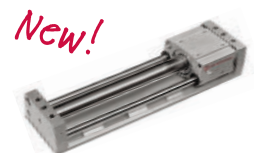
MC Series MCHL 1-1/16" - 1-1/2" Bores Magnetically Coupled Rodless High Load Guided Cylinder