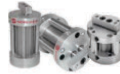
FPT Series F-Plus Twin Rod, Non-Rotating 3/4" - 2" Bores Double Acting