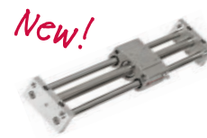
MC Series MC2S/MC3S 5/16" - 2" Bores Magnetically Coupled Rodless Guided Cylinder