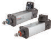
PRA/882000, PRA/862000 IVAC Cleanline PRA/882000 IVAC Industrial PRA/862000 32mm-100mm bores Double Acting, cylinder/valve