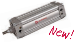
P-Series Aluminum NFPA 1-1/2" - 4" Bores Double Acting, Adaptive cushioning