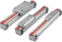
C/146000 Lintra® Plus Rodless Cylinder 16mm - 80mm Bores Internal, External, Roller Carriage