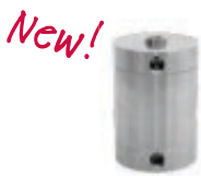
F-Plus All Stainless Steel Compact Corrosion Resistant cylinder 9/16" - 4" bores IP69K ingress protection