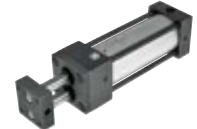
N Series Non-Rotating NFPA 1-1/8" - 4" Bores Double Acting