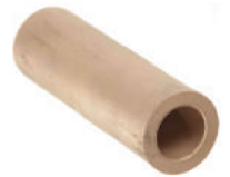
■ Cored Bar Stock