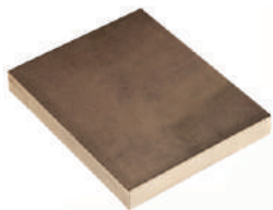
■ Rectangular Plate Stock