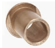
■ Flange Bearings