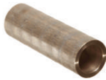
■ 13" Continuous Cast Bronze Bars Cored