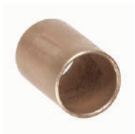
■ Sleeve Bearings

OILUBE® SAE-841 Oil-Impregnated Powdered Metal Bearings are available in these configurations