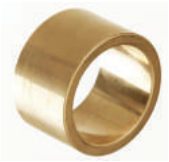
■ Sleeve Bearings

CENTURY® SAE-660 Cast Bronze Bearings are available in these configurations