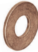
■ Thrust Washers