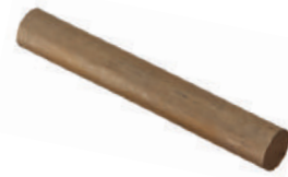
■ 13" Continuous Cast Bronze Bars Solid

■ Custom Bearing Solutions are also available. Consult our Catalog for grease groove recommendations.