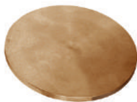
■ Round Plate Stock