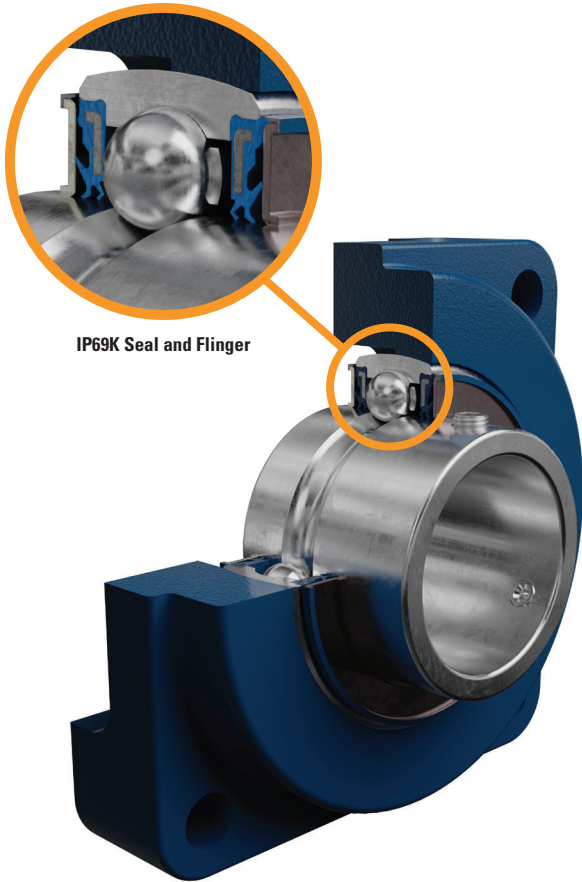
IP69K Seal and Flinger