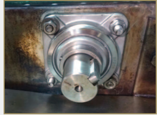
PEER Bearing after 1 year in use.