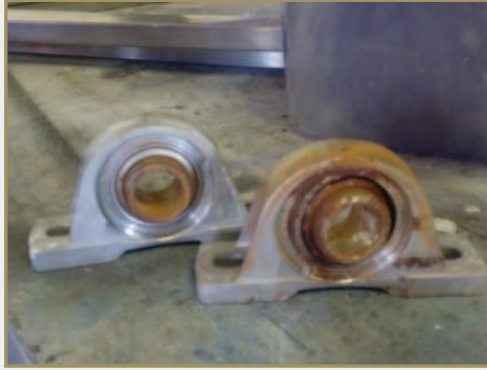
Competitor after 90 days in use.

On the left side, a competitor's bearing after 90 days vs. PEER Bearing after 1 year on the right side.