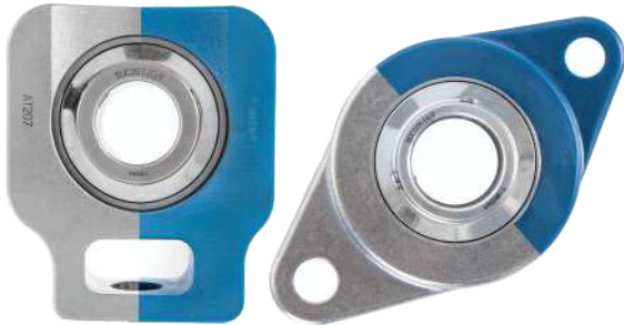
Hygienic blue polymer (thermoset)