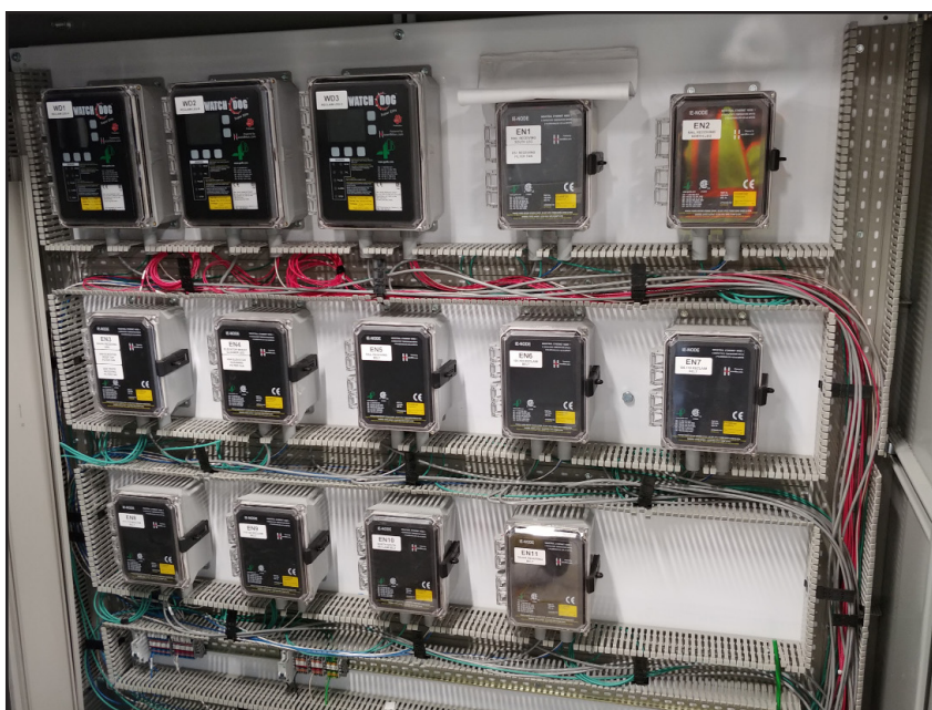
Panel of IE-Nodes