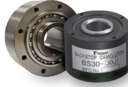
BACKSTOPS & OVERRUNNING CLUTCHES