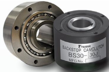
Backstops & Overrunning Clutches