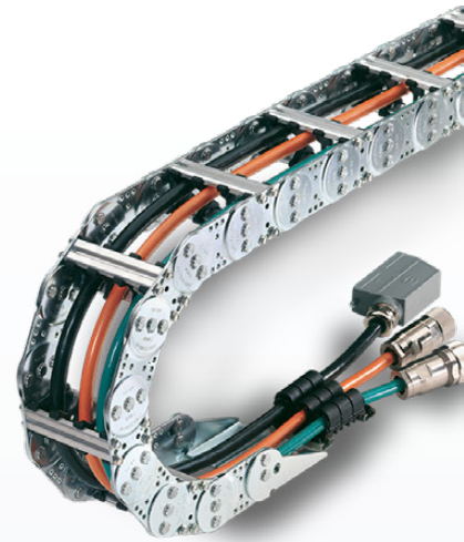
Steel Cable Carriers