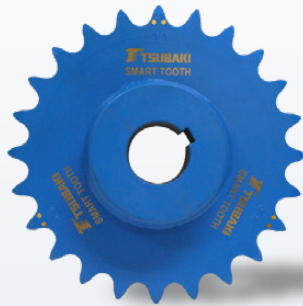
SMART TOOTH® Sprockets