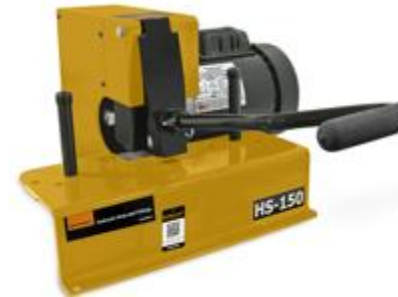
HS-150 Saw (20614553)