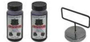
RCD Spare Parts Kit (21053593)