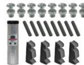
PC200i Spare Parts Kit (21053596)