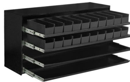
Hydraulic Fittings Bin (20240780)