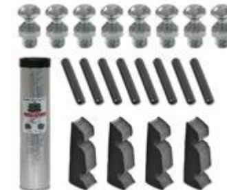
PC150HD Spare Parts Kit (21099232)