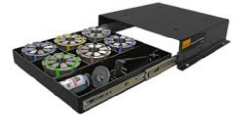
PC125RCD Skit w/ 8 dies & cabinet (20809573)