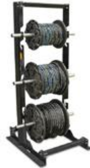
36" Hose Rack (21024823)