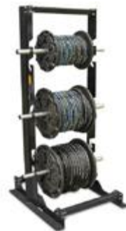
36" Hose Rack (21024823)