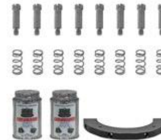
PC150 Spare Parts Kit (21053594)