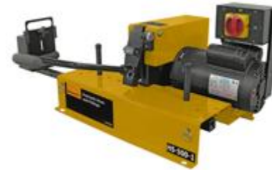
HS-501 Saw (20614557)