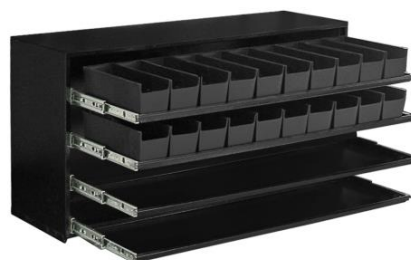
Hydraulic Fittings Bin (20240780)