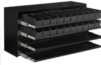
Hydraulic Fittings Bin (20240780)