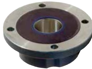
URETHANE BACKING PLATE

Provides an extra barrier for any flange block application requiring secondary sealing from the back side