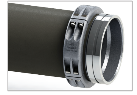
GSHD2 ASSEMBLED WITH LAY-FLAT HOSE AND HD2 CLAMP ASSEMBLY

GSHD2 HD2 X VICTAULIC® GROOVE CONNECTION