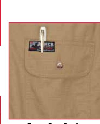
Front Pen Pocket