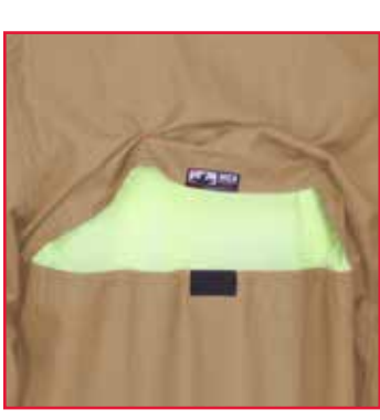
FR Mesh Back Vent