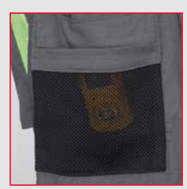
Mesh Gas Monitor Pocket