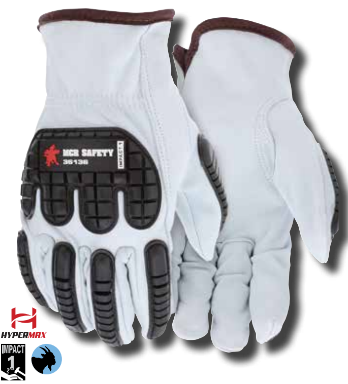
36136 Sizes: M-XL · Unlined for excellent sense of touch